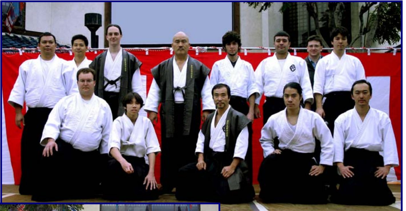
Japanese Village Plaza Demo