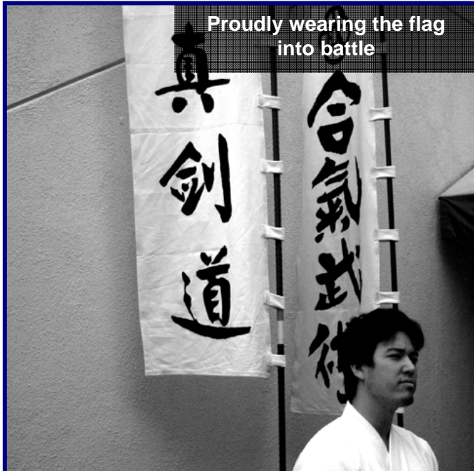
Proudly wearing the flag into battle