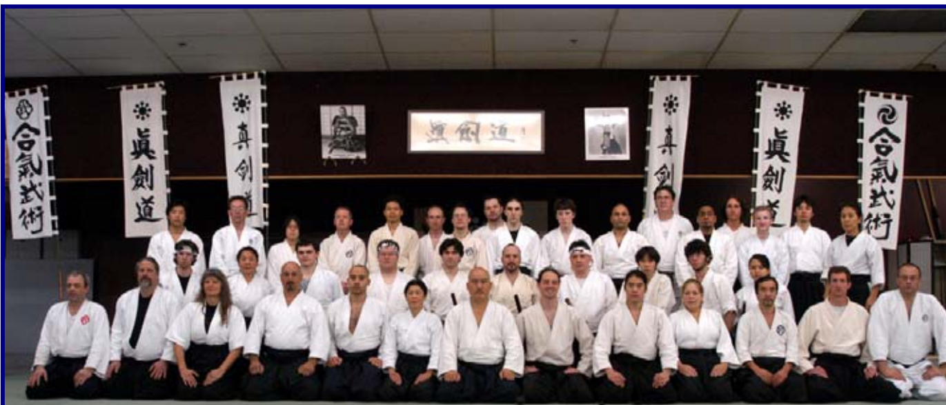
The Extended Family