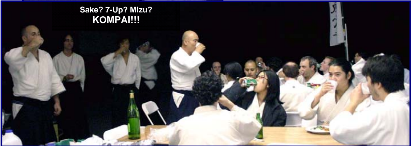
Sake? 7-Up? Mizu? KOMPAI!!!