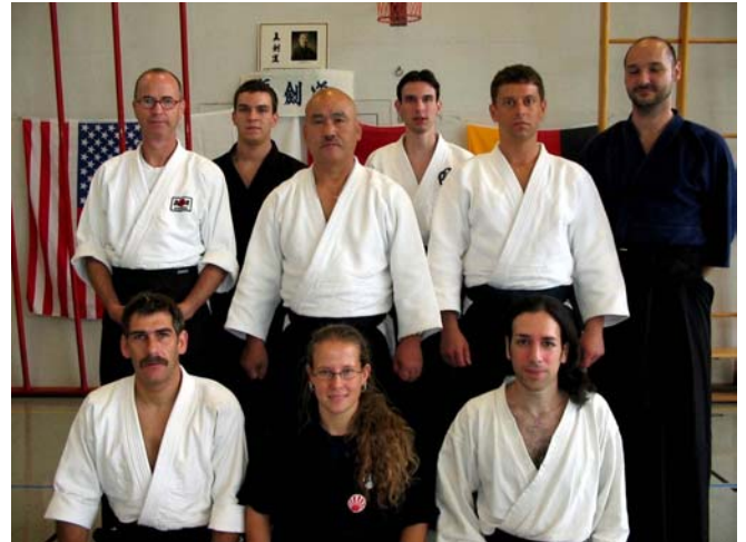
Swiss-team with Sensei