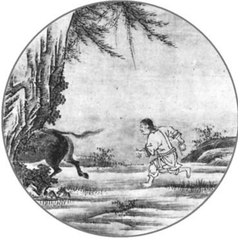
Pursuing the Ox