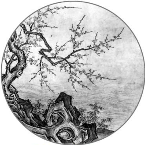
Returning to the Source

One does not graduate from budo—the path of budo is a lifelong endeavor. This is in fact what budo means.