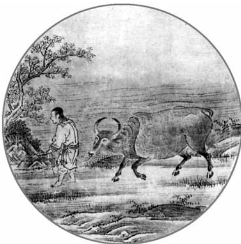
Taming the Ox

This time around, the 6’5” young man from the foothills of the Wasatch Mountains learned to wear hakama, sit in seiza, and count in Japanese. He practiced for hours on end, fascinated by the play between mind and body, sword and body, arms and legs—until the sword became an extension of his very being. Wielding this deadly force had become his vehicle for self-expression.