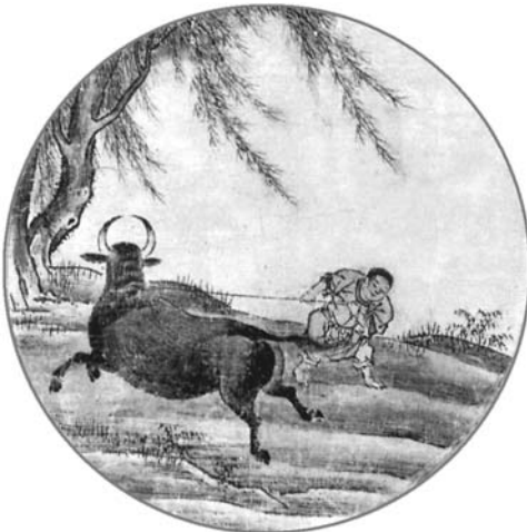
Catching the Ox