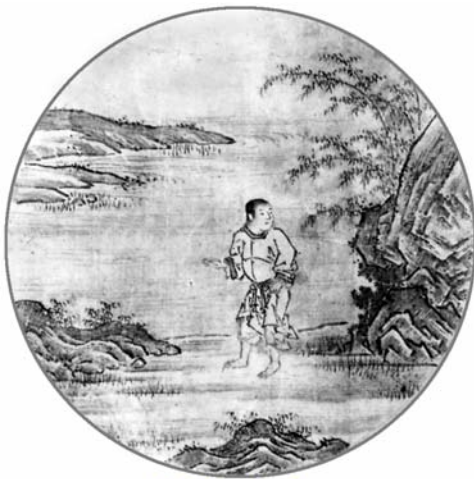
Seeking the Ox