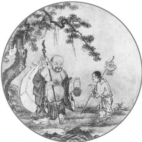
Entering the City with Open Hands