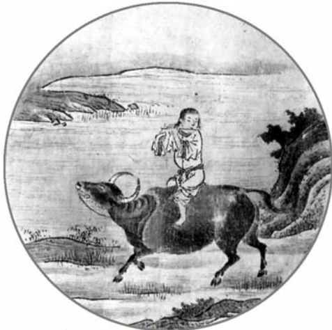
Returning Home, In Harmony

training was already familiar to him. The reiho, discipline and principles of the samurai seemed remarkably similar to the values transmitted by his own father and grandfather. The more he practiced and studied under his Shinkendo sensei, the more he was able to see the parallels between East and West. And most importantly, the more he came to understand his own sense of history and lineage.