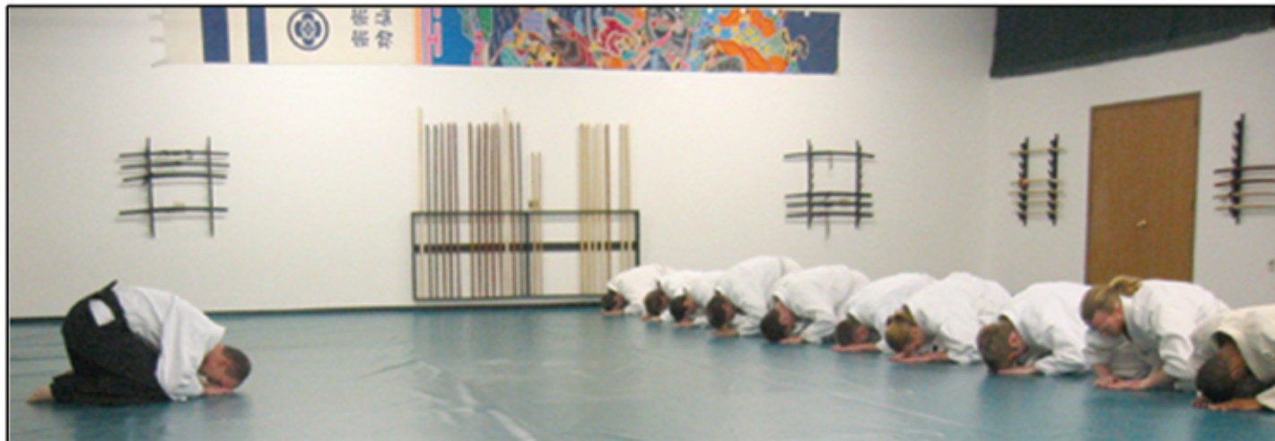
Bowing out respectfully after a good training session. Now it’s time to clean that 1800 sq. ft. floor!

So, in truth, aikido really is all about the love. Don’t let the perceived violence of our techniques fool you into thinking that we miss the point of aikido – our love and loyalty is real and compelling, as are our techniques.